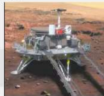
Great leap: An artistic depiction of the Chinese Mars rover and lander.

Lunar probe makes world's first landing on “far side” of the moon