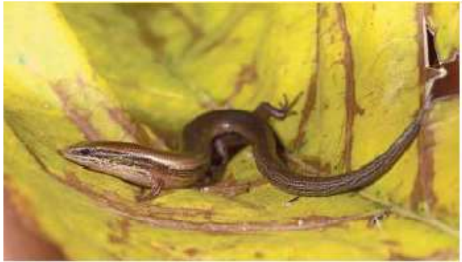
Slinky find: Named Subdoluseps nilgiriensis , the reptile has a slender body of just about 7 cm and is sandy brown in colour. ▪

Researchers have discovered an Asian gracile skink species from Western Ghats.