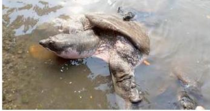
The freshwater black softshell turtle. ■ SPECIAL ARRANGEMENT