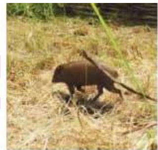
One of the pygmy hogs reintroduced in Assam's national park on Tuesday.